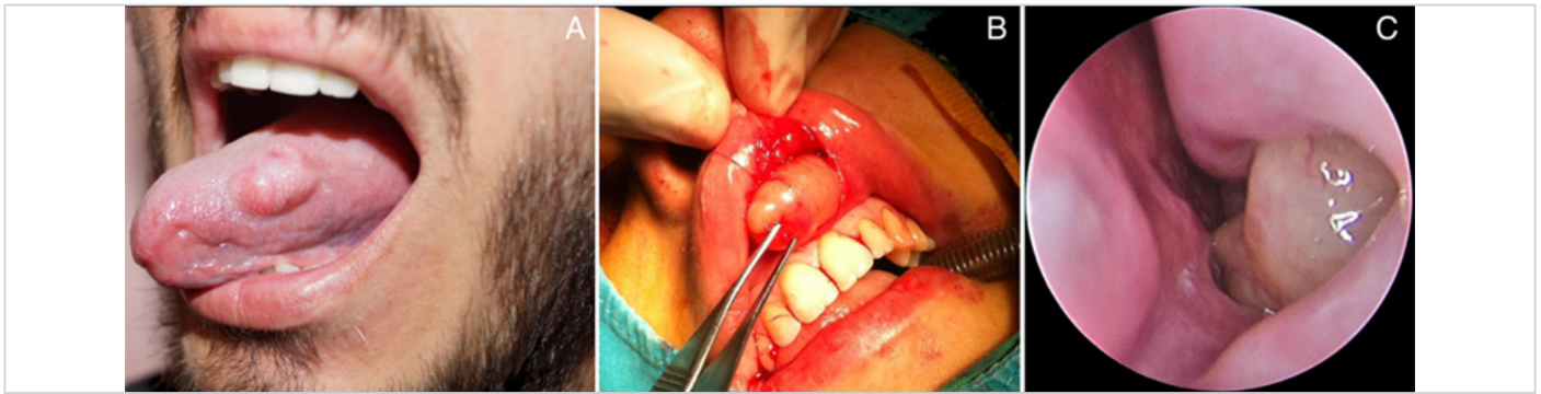
Figure 1. Clinical and intraoperative images of schwannomas located in various regions of the head and neck. a) Well-circumscribed lingual schwannoma presenting as a submucosal mass on the tongue. b) Intraoperative view of an encapsulated upper lip schwannoma during surgical excision. c) Endoscopic image showing a left-sided sinonasal schwannoma located in the inferior meatus

Preoperative imaging was performed in approximately one-third of the patients to support differential diagnosis based on lesion localization. Ultrasound was utilized in three patients with neck lesions and in two patients with scalp lesions due to suspicion of malignancy; all lesions were reported as benign. MRI was preferred in cases requiring deeper tissue evaluation, including two patients with unilateral nasal cavity lesions, one with a tongue lesion, and one with a facial mass in the temporoorbital region. All MRI findings were consistent with benign pathology (Figure 2).