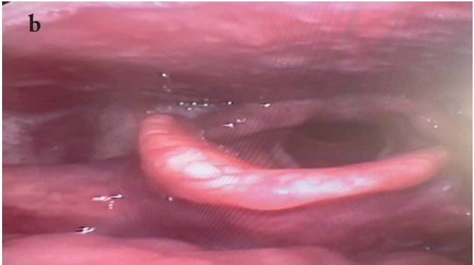
Figure 4. a) View of granulation tissues in the larynx in the 1^{st} week after surgery, b) View of the larynx at 6-month follow-up after surgery

small airway, they are generally asymptomatic in adults and most of them are diagnosed incidentally. The foreign body sensation in the throat, difficulty in swallowing, and changes in voice are the most commonly observed complaints related to the laryngeal involvement of dermoid cyst in symptomatic adults (8). Our case presented with all of the most common complaints.