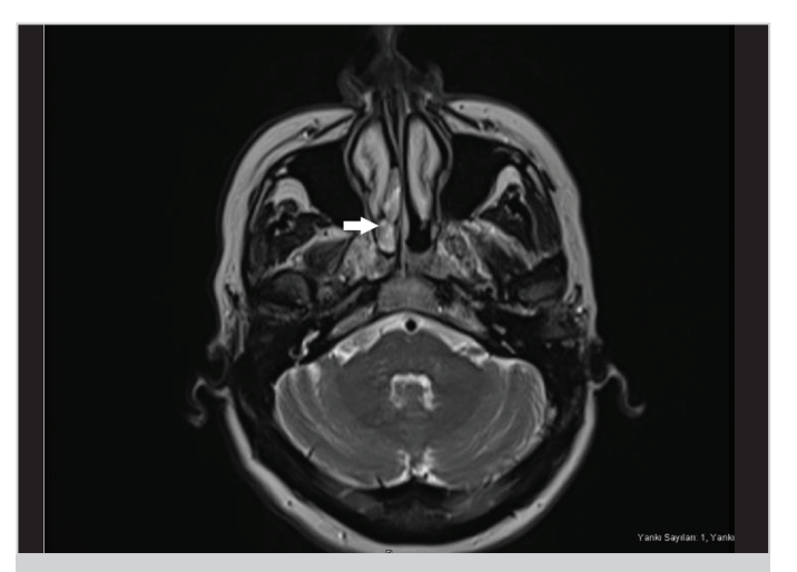
Figure 3. b. A hyperintense lesion was observed in the right nasal cavity on T2-weighted sequences of MRI MRI: Magnetic resonance imaging

(6). The disease progresses slowly and does not metastasize; however, local recurrences occur in approximately one third of the patients within the first five years after surgery (5). The recurrence rate is approximately 40% to 50%, with recurrence-free intervals ranging from less than one year to more than nine years (7). In the literature, mortality from BSNS is quite rare, with only two reported cases of tumor related death (8, 9).