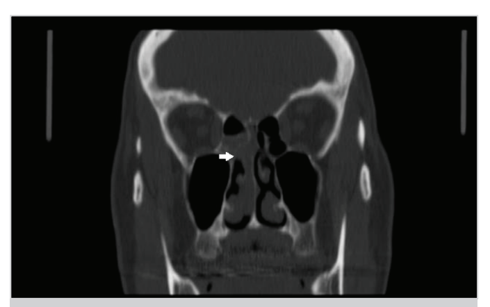
Figure 2. A polypoid mass in the right nasal cavity and mucosal thickening in the sphenoid sinus were observed in the coronal section of paranasal sinus CT CT: Computed tomography