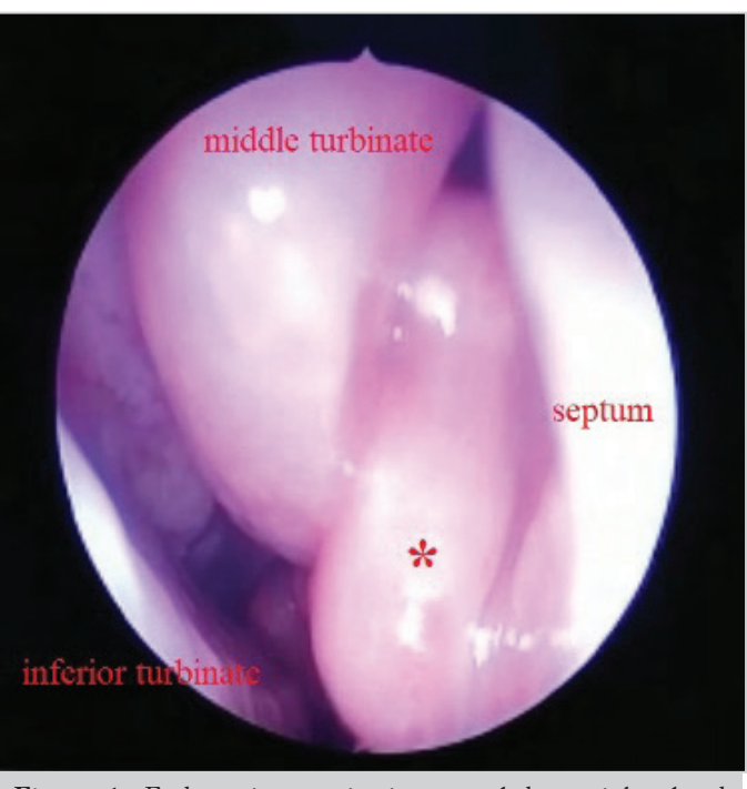
Figure 1. Endoscopic examination revealed a pink-colored hemorrhagic polypoid lesion hanging from the right nasal cavity from the middle meatus

Nasal endoscopy revealed a pink-colored, hemorrhagic polypoid mass protruding from the right middle meatus to the choana (Figure 1). Other head and neck examinations revealed no abnormalities. Paranasal sinus computed tomography (CT) showed a massive lesion filling the right middle meatus and the right posterior ethmoid cells, and mucosal thickening in the sphenoid sinus (Figure 2). Contrast-enhanced magnetic resonance imaging (MRI) was planned because of the atypical hemorrhagic appearance of the lesion. A mass lesion with an irregular contour of approximately 4x4x1 cm, hyperintense on T2-weighted sequences, hypointense on T1-weighted sequences, enhancing after intravenous contrast agent, and not diffusion restriction, was observed as a result of MRI (Figures 3a and 3b). There was no orbital or skull base extension of tumor. First, an endoscopic biopsy was planned from the mass in outpatient clinic conditions. After the histopathology results