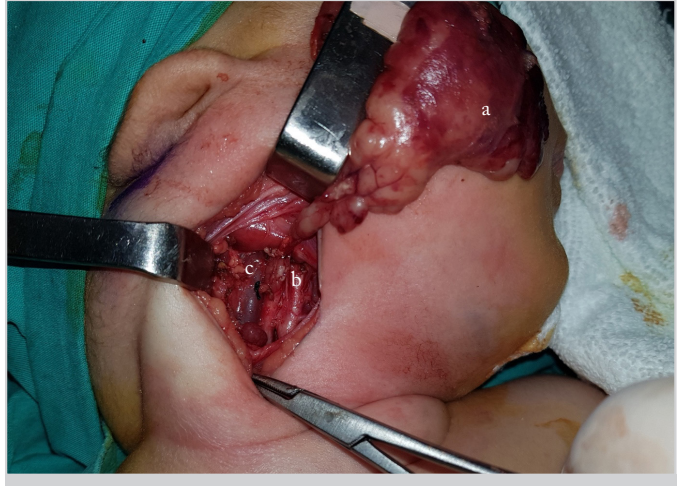
Figure 3. Excision of the solid mass; view highlighting its vicinity to major vasculature. a. solid mass, b. carotid artery, c. internal jugular vein