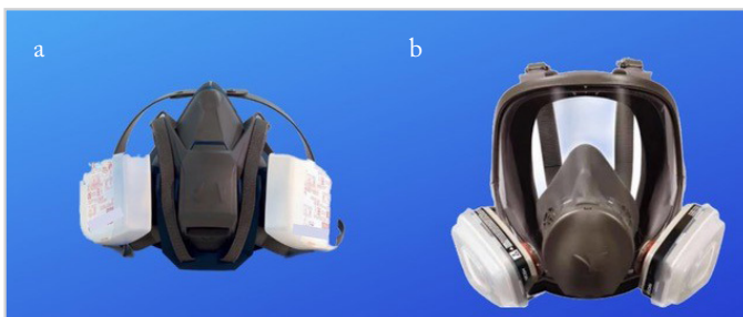
Figure 3. a, b. Elastomeric respirators (a) partial-face, (b) full-face