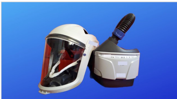
Figure 4. Powered air-purifying respirator

One of the main reasons for intolerance to FFP 2 and 3 usage is breathing problems. Therefore, some FFP 2 and 3 masks may have a breathing valve (ventilation). Breathing (especially during expiration) is much easier while using FFP masks with a breathing valve. However, users may still spread droplets, even though an FFP mask with a breathing valve may effectively protect against SARS-CoV-2 transmission. Therefore, FFP masks with a breathing valve should be used attentively in healthcare settings, and anyone using an FFP mask with a breathing valve should also wear a covering surgical mask (20).