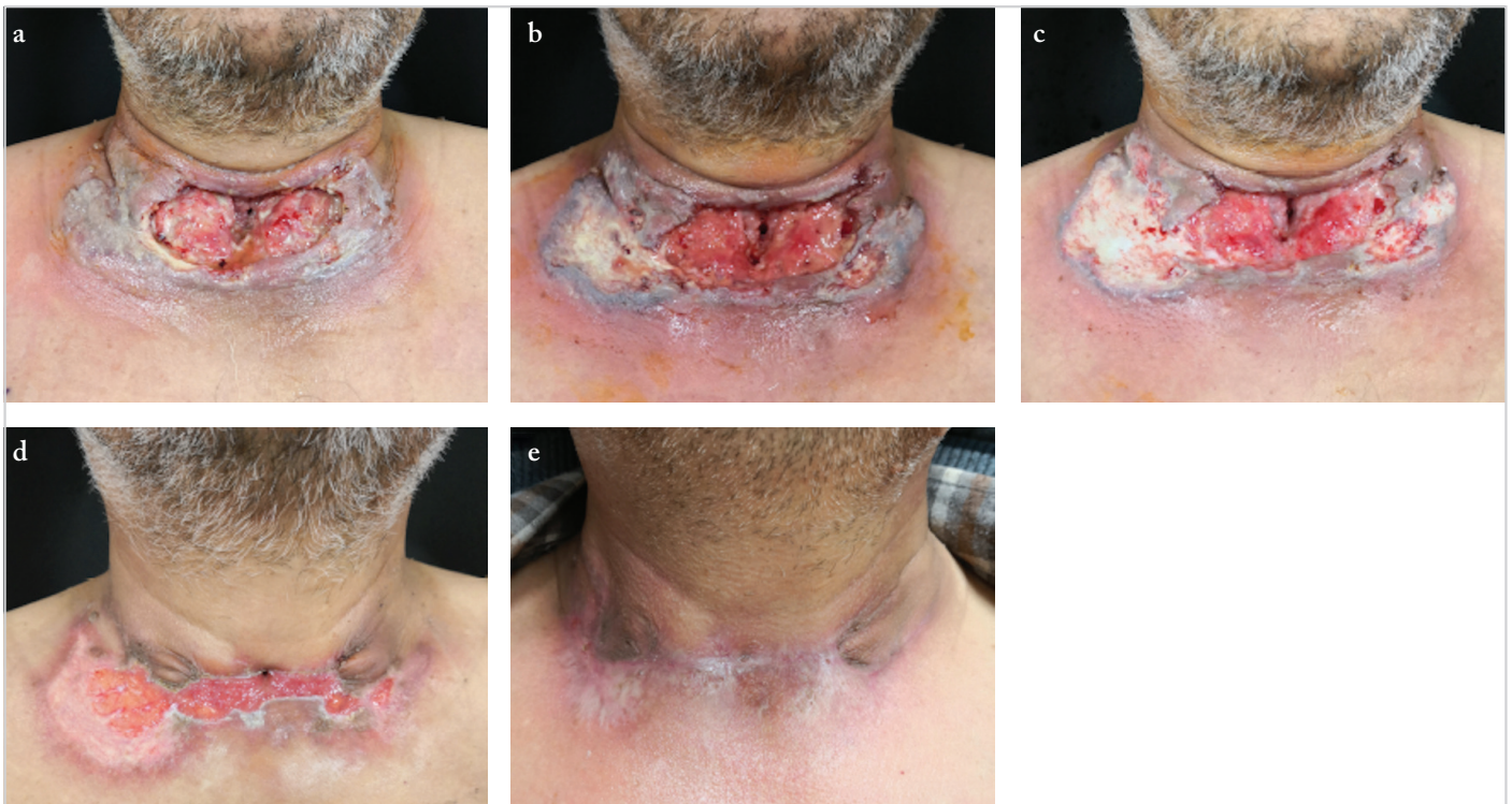
Figure 3. a-e. View of the wound defect with severe necrosis and fasciitis on the seventh postoperative day (a). View of the wound defect with severe necrosis and fasciitis surrounding with black-colored area on the eighth postoperative day (b). The surrounding black-colored area reduced with antifungal treatment on the ninth postoperative day (c). View of the epithelialization starting from the outside of the skin defect on the 20 th postoperative day (d). View of the neck after complete epithelialization (e)