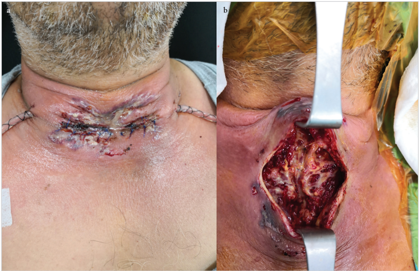
Figure 2. a, b. Black-colored skin necrosis around the drainage catheter and the incision line on the sixth day after neck exploration (a). Necrosis in the skin and the subcutaneous tissue on the sixth postoperative day during second neck exploration (b)