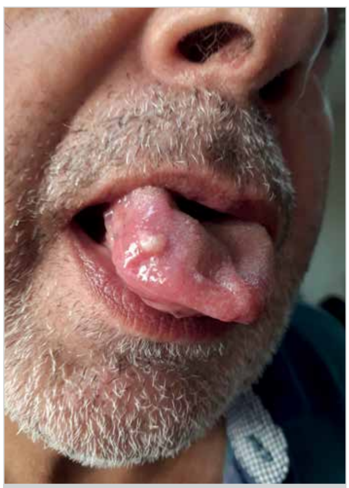
Figure 1. Tender and hemorrhagic mass on the right side of the tongue due to colon adenocarcinoma metastasis