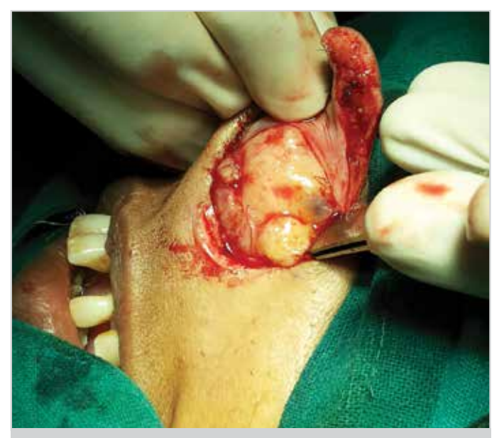
Figure 3. The lateral rhinotomy incision, elevated flap, and mass occupying the nasal cavity with an attachment on the septum

Histopathologic examination showed the presence of respiratory epithelium with the absence of capsules (Figure 4). A high-power examination showed a tumor with spindle cells arranged in the Antoni A pattern and Verocay bodies, suggesting a schwannoma.