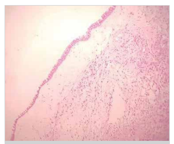
Figure 4. Low-power (10X), H&E stained microscopic slide picture showing the presence of hyperplastic respiratory epithelium with the absence of a capsule