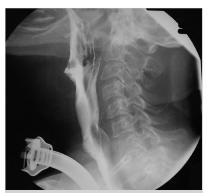
Figure 3. Postoperative barium esophagography showing a functioning neopharynx

Fistula was observed in 11 patients (47.8%). Six of these patients had laryngeal tumors, three had hypopharyngeal tumors, and two had esophagus upper segment-located tumors. All the fistulas were observed in the anastomose region between the upper side of the flap and tongue base. In all patients, the fistula was closed with conservative methods without the need of an additional surgical operation within nearly four weeks.