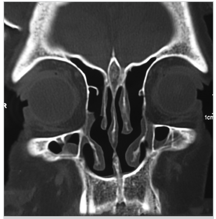
Figure 4. Control PNS CT in the 4th postoperative month

having an osteoma located in the frontal recess and smaller than 1 cm in diameter. Osteoma excision was performed using an endoscopy guided burr. Combined treatment was applied to the patient in whom osteoma excision was performed in the right frontal sinus through the external approach in an outside medical center in 2004 and in whom recurrence was detected in the five-year follow-up. The patient had an osteoma showing