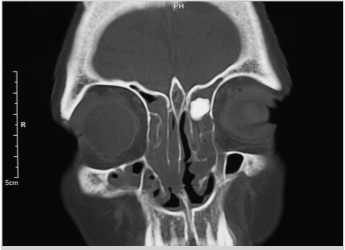
Figure 2. Preoperative PNS CT of the patient who had undergone the endoscopic approach