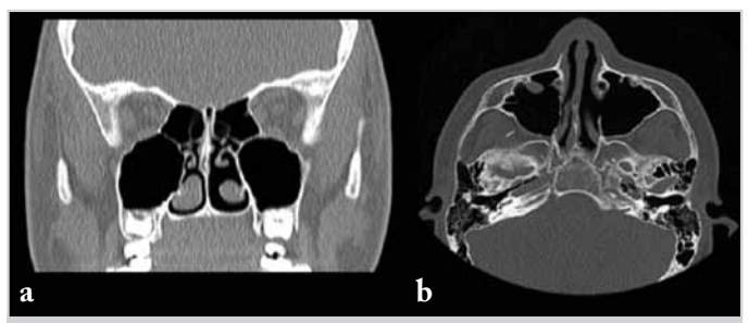
Figure 3. a, b. In coronal and axial sections of paranasal sinus computed tomography performed in the 3<sup>rd</sup> postoperative month, no recurrent mass lesion was observed in the maxillary sinus and osteomeatal unit

In contemporary literature, the number of published case reports on inverted papilloma in childhood and/or adolescence is lower than 20. It was first reported by Eavey (5), who made a classification for childhood and adolescence according to 3 patients at the ages of 6, 12, and 20 years. The disease recurred in 2 patients and was treated with surgical operation. Moreover, Özcan et al. (4) reported that a 9-year-old pediatric patient was treated due to recurrent inverted papilloma.