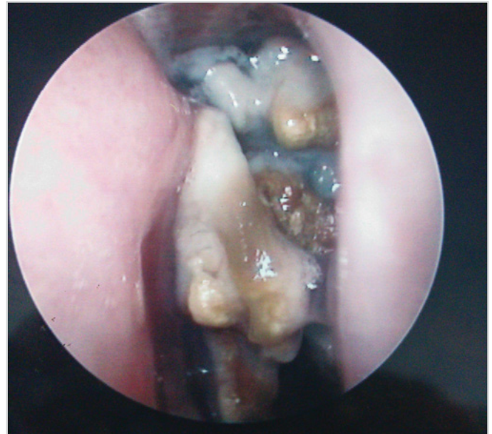
Figure 3. Irregular hard mass and friable mucosa at the inferior meatus

An exogenous source is more common in adults, although exogenous sources of rhinolith have been reported (2, 6, 8). The most common location for rhinoliths in most cases is the inferior nasal meatus (2).