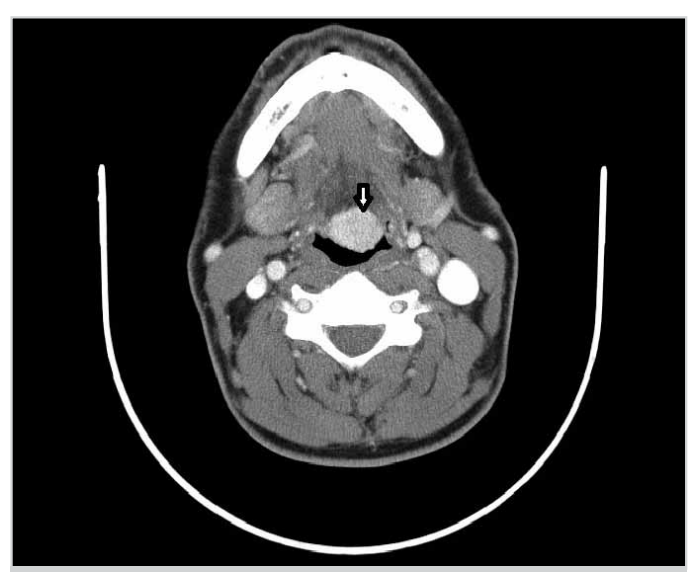
Figure 2. Ectopic lingual thyroid under contrast-enhanced computed tomography (white arrow)