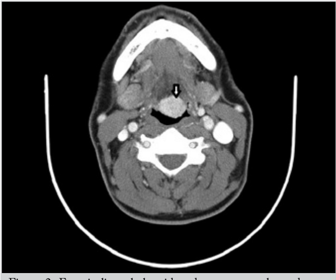
Figure 2. Ectopic lingual thyroid under contrast-enhanced computed tomography (white arrow)

thyroid with sublingual, submandibular, prelaryngeal, tracheal, esophageal, and mediastinal locations may be observed. Ectopic thyroid tissue located in the mesentery of the mediastinum, heart, porta hepatis, diaphragm, lung, duodenum, adrenal gland, and the small intestine has also been reported (3, 4). Adenoma, hyperplasia, inflammation, and malignancy seen in the normal thyroid gland can also be observed in the ectopic thyroid tissue (7). Differential diagnosis of lingual thyroid includes hemangioma, lymphangioma, fibroma, adenoma, lipoma, angioma mucous retention cyst, dermoid cyst, salivary gland tumor, tongue base tumor, and lingual thyroid cancer (3, 8).