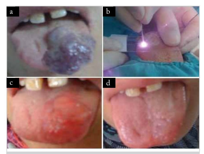
Figure 1. Case 1 (a) preoperative (b) intraoperative (c) postoperative tenth day (d) postoperative first month

Diode laser photocoagulation was planned and laboratory carried out for blood coagulogram preoperatively. Photos were taken for comparison with post-operative results and the lesion was measured to the nearest millimeter. Patients were provided with information about the procedure and