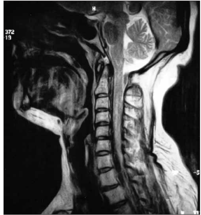
Figure 1. Sagittal T2 weighted MRI scan: Focal nodular thickening on the posterior wall of nasopharynx.

Magnetic resonance imaging (MRI) scan centered on the nasopharynx, showed focal nodular thickening on the posterior wall of nasopharynx. Multiple lymphadenopathy was found on left sub-mandibular region, deep jugular and spinal accessory chain. Maximal diameter of the lymph nodes was 2.5x2 cm.