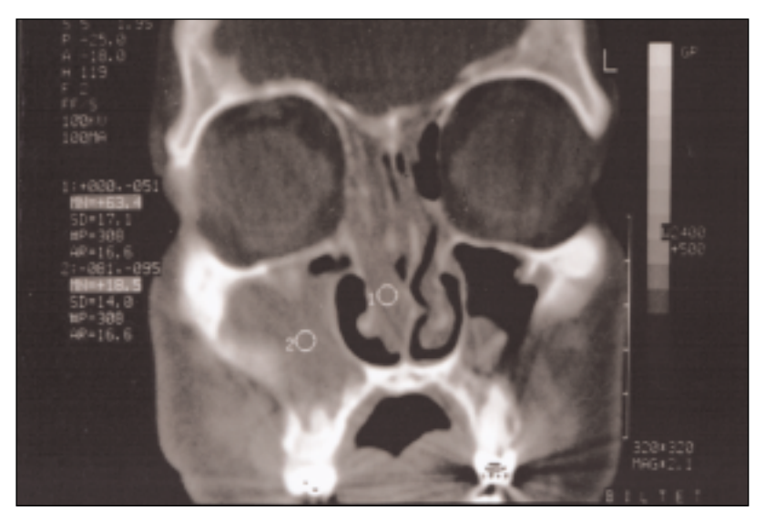
Figure 1. The coronal section of the paranasal sinus CT revealed chronic right maxillary and bilateral ethmoid sinusitis, septal deviation and left maxillary retention cyst.