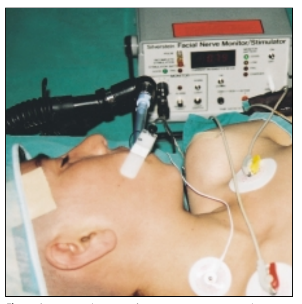
Figure 1. Proper placement of strain-gauge sensor in mouth.