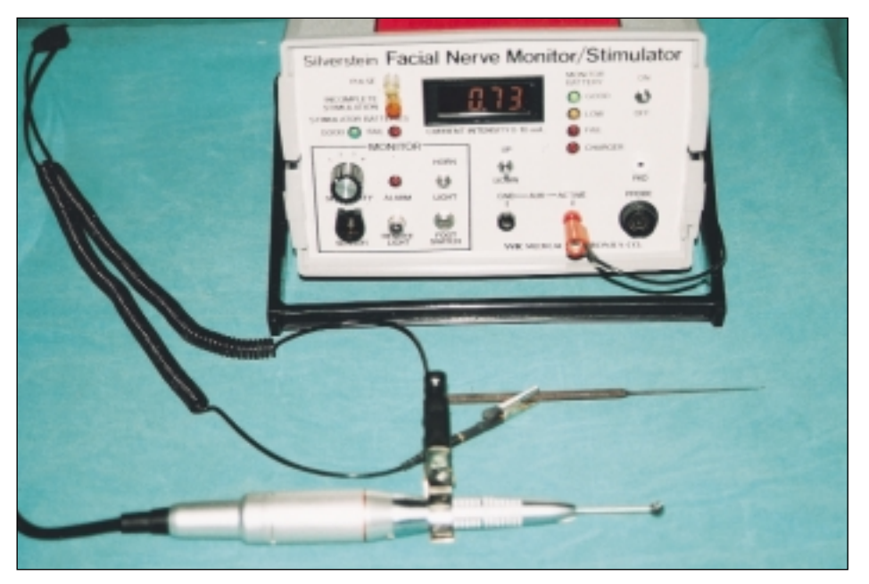
Figure 3. A drill was connected to one of the adapter's clip and a microsurgery device to the other clip.