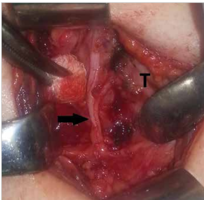
Figure 2. Appearance after excision of the diverticulum (T: trachea; black arrow: recurrent laryngeal nerve)

tissues. After skeletonization, it was seen that the mass was originating from the inferior border of cricopharyngeus muscle. It was diagnosed as a diverticulum after needle aspiration of air. The diverticulum was completely resected, and the mucosal defect was primarily sutured (Figure 2). During the postoperative period, no vocal cord palsy was seen. After 3 days of nasogastric feeding, oral alimentation was started. Dysphagia disappeared two weeks after surgery. Histopathological examination of lobectomy was papillary thyroid carcinoma and histopathological examination of the diverticulum material revealed false diverticulum without a muscular layer. Barium esophagography showed neither stenosis nor recurrence of diverticulum after one year of follow-up (Figure 3). Informed consent was obtained to use intraoperative photographs, documents, and barium X-ray images for the case report from the patient.