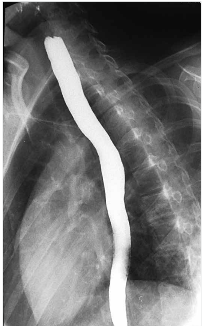
Figure 3. Barium esophagography after a 1-year follow-up

Swallowing is a complex reflex comprising voluntary and involuntary phases. It involves a sophisticated organization of sensorial input of the cranial nerves and motor output by the upper aerodigestive system muscles (1). Any structural or neurological defect in this organization results in dysphagia.